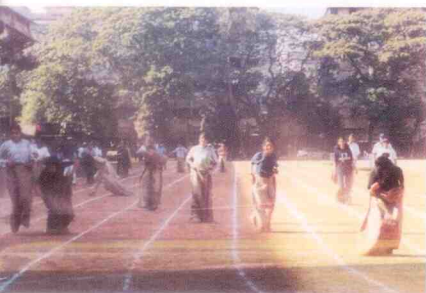
SACKED OUT? Not quite!

L oud cheers rent the air as zest-filled racers breasted the tape. The scene at the Annual Sports Meet at the University Grounds, on March 20, 1998, was one